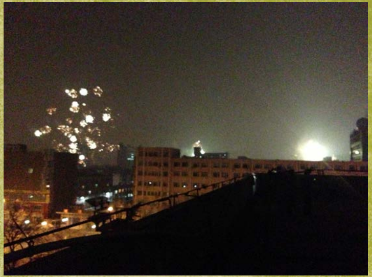
A glimpse of the fireworks over China's rooftops.

"China's Lunar New Year delivered the most insane display of pyrotechnics I have ever seen; it is safe to say that the 4th of July will never be quite the same again. For three days nightfall brought an unceasing barrage of fireworks; the noise and light echoed and reflected throughout Beijing. There was an unceasing roar that built throughout the night until it reached a deafening crescendo around midnight. Frankly, I am amazed that I didn't see anyone get seriously injured or any buildings go up in flames. People were literally launching rockets out of their apartment windows and chucking firecrackers out of cars as they were driving. It was an amazing display to watch, one that left the whole city covered in a haze of smoke."